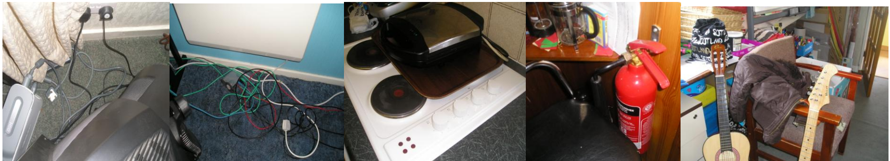
Aims 1 – Photographs taken by young carers highlighting fire risks and fire safety around Victoria Cottage (for Visual Quiz sheets)