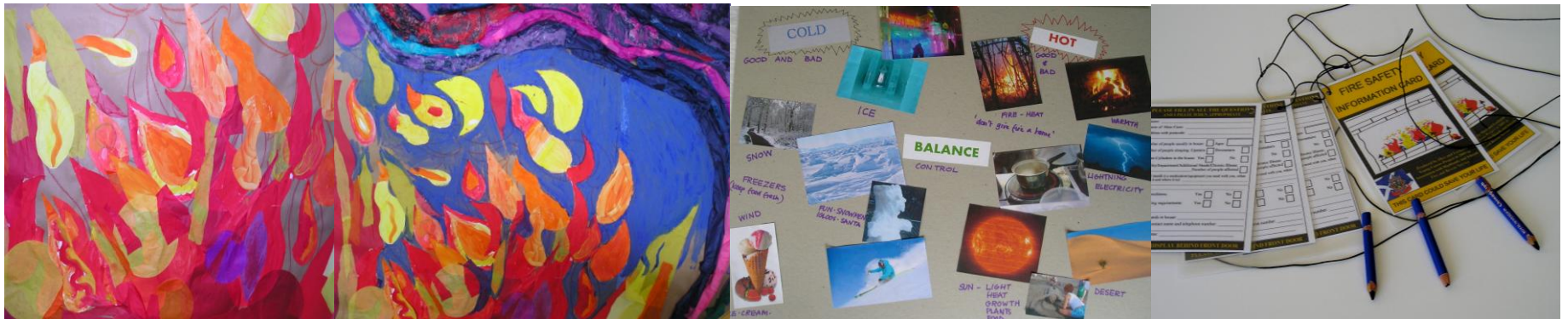
Aims 1,3,5 – Large fire collage, Hot/Cold topic sheet and Home Fire card