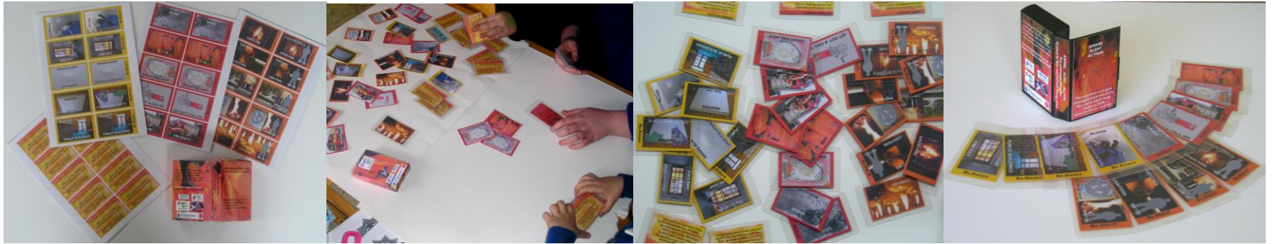
Aims 2,5 – Fire Safety card game developed