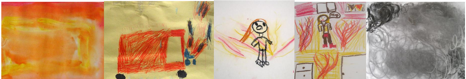
Aims 1,3 – Drawing and painting – fire risks and actions for the fire safety card game