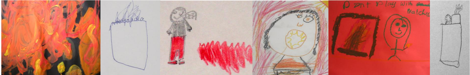
Aims 1,3 - Drawing and painting – fire risks, action in a fire, fire and smoke, all for the fire safety card game