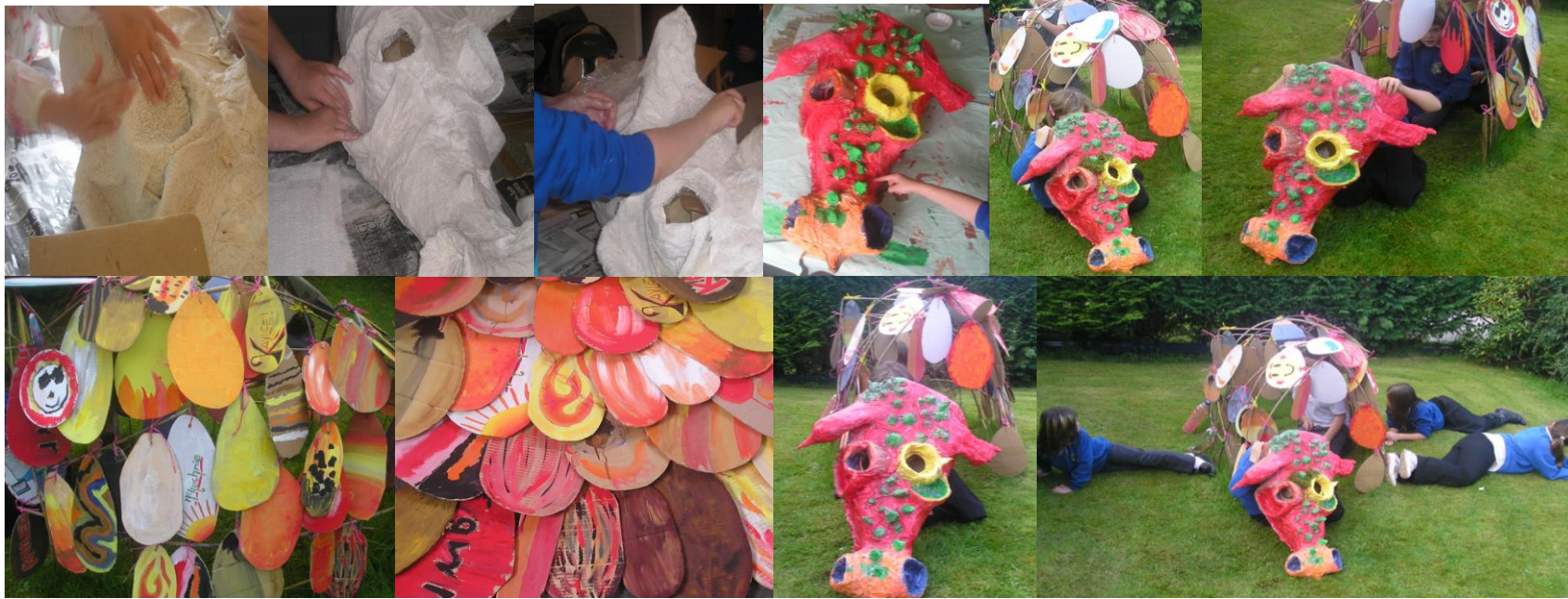
Aims 3,5 - Building the fire monster and developing his story through role play